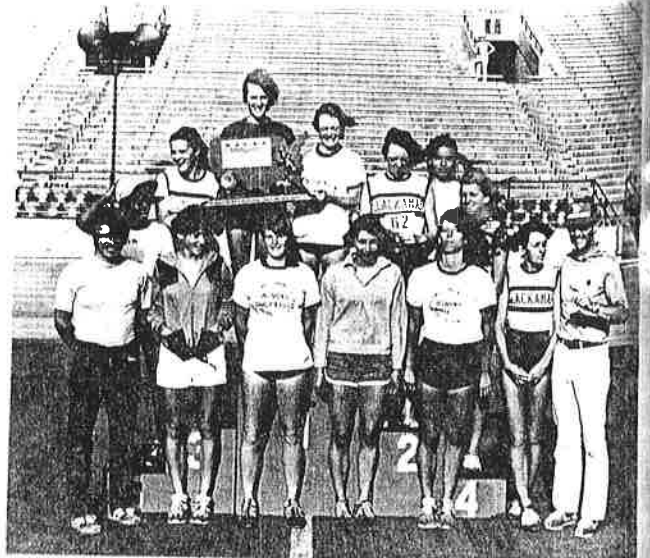
1978 National Champions — Clackamas CC, Oregon City, Oregon