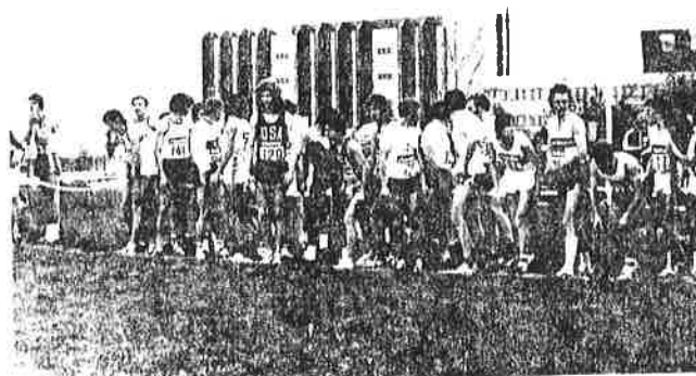
Start of the 1st World University Cross Country Championships