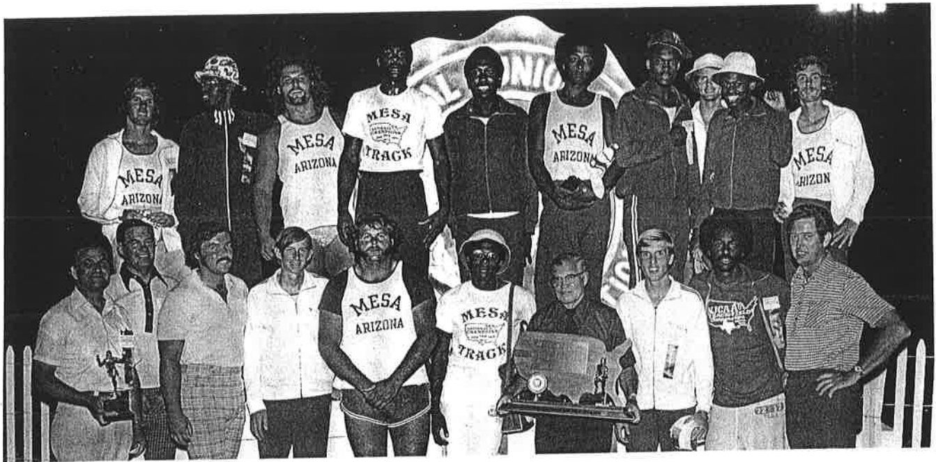
Mesa Community College, Mesa, Arizona 1974 National Track and Field Champions

Mesa Community College, Mesa, Arizona won the 34th Annual NJCAA Track and Field Championships held at San Jacinto college, Pasadena, Texas. In winning its fifth championship in the last seven years, Mesa scored 72 points to outdistance Essex County College, New Jersey who finished second with 54 points.