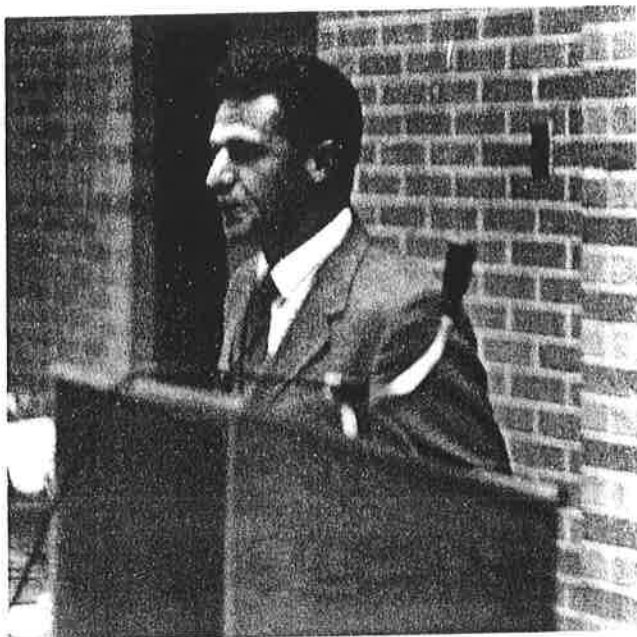
Arthur Lydlard, famous New Zealand track coach, addresses 1970 NJCAA Track Coaches Association clinic.