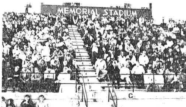
Crowd at Memorial Stadium in Garden City, Kansas, watch the meet in cold windy weather.